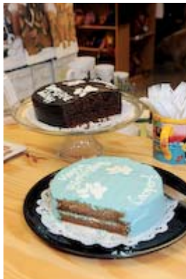
Cooper's cakes! Carob w/carob peanut butter frosting, & carrot w/cream cheese frosting - YUM!